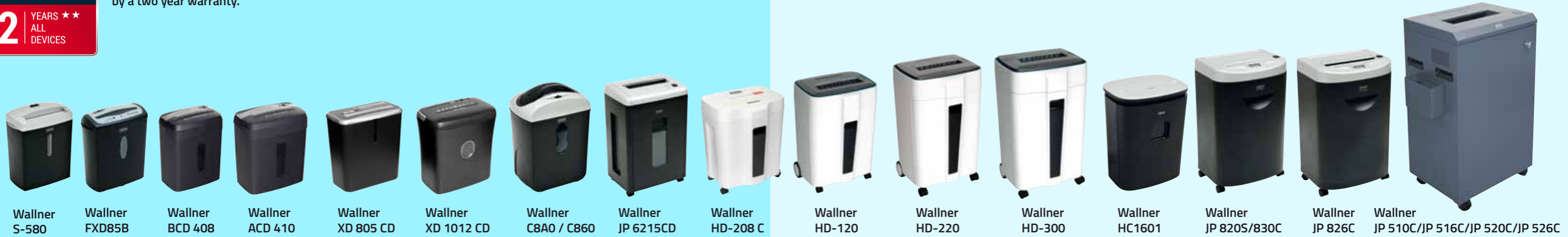
Wallner S-580 Wallner FXD85B Wallner BCD 408 Wallner ACD 410 Wallner XD 805 CD Wallner XD 1012 CD Wallner C8A0 / C860 Wallner JP 6215CD Wallner HD-208 C Wallner HD-120 Wallner HD-220 Wallner HD-300 Wallner HC1601 Wallner JP 820S/830C Wallner JP 826C Wallner JP 510C/JP 516C/JP 520C/JP 526C

All Wallner shredders are covered by a two year warranty.